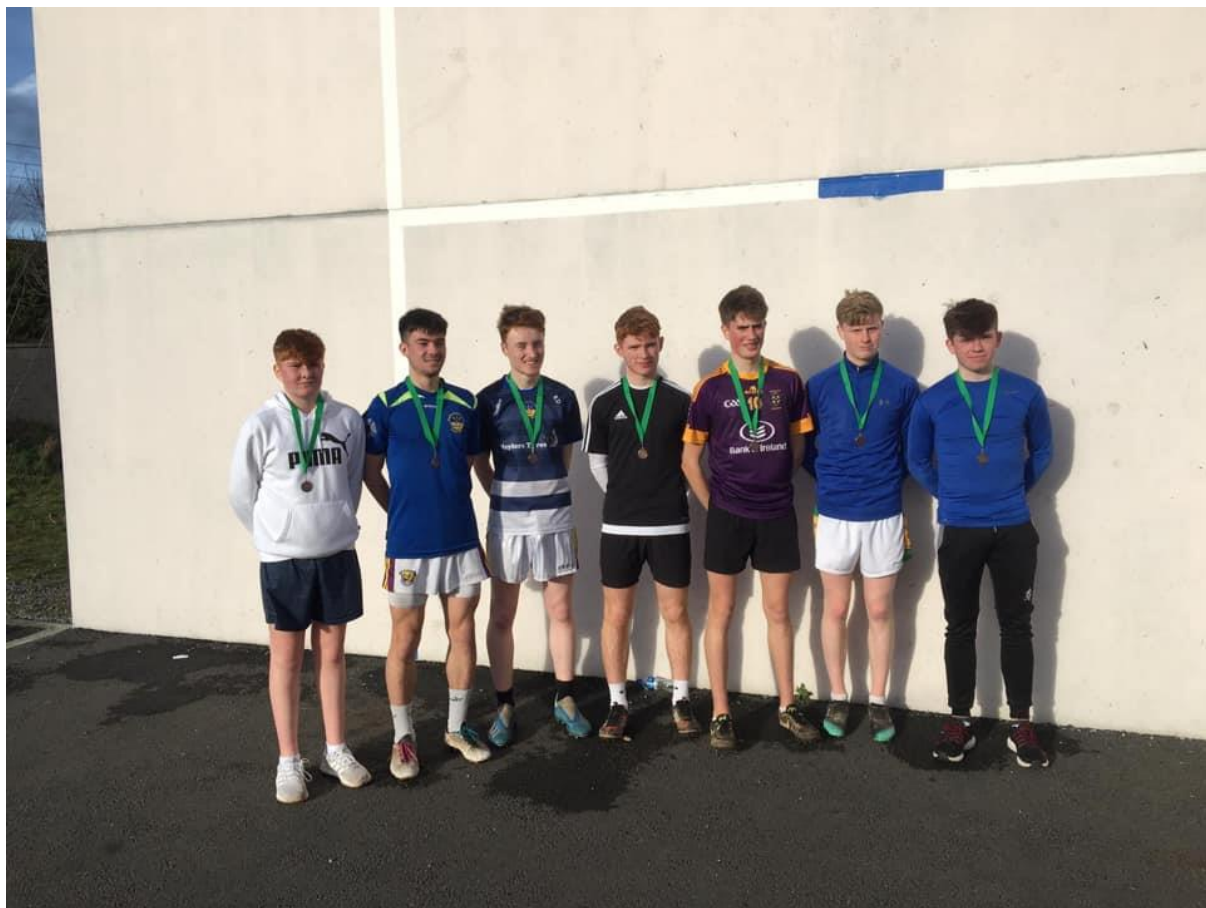
The senior boys' team at the south Leinsters in Carlow