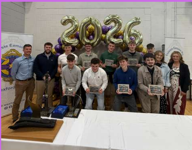
Zambia Immersion Project