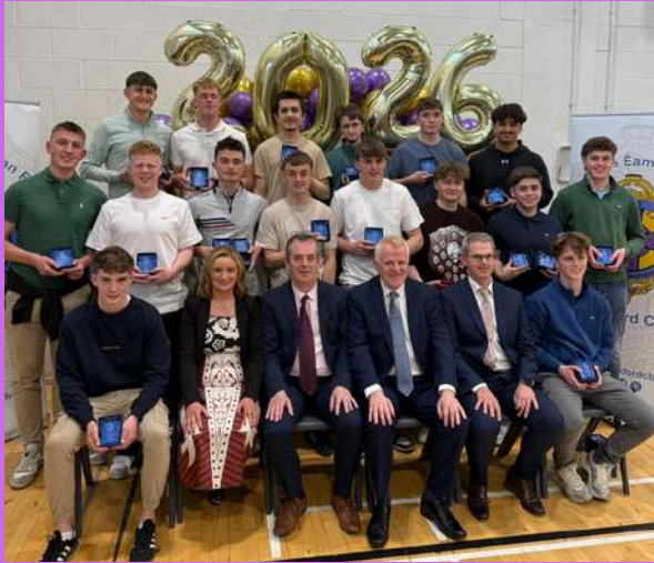
Subject Award Winners