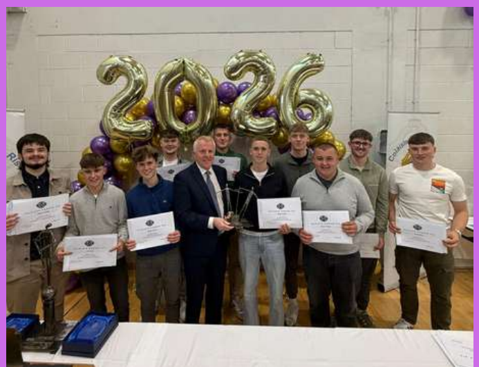
Kathleen Fahy Award Nominees